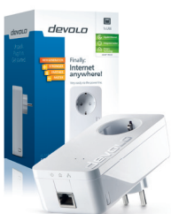
dLAN® 650+ Addition