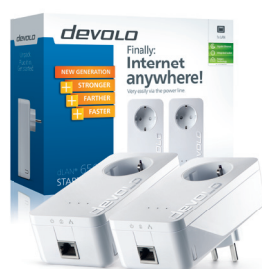
dLAN® 650+ Starter Kit